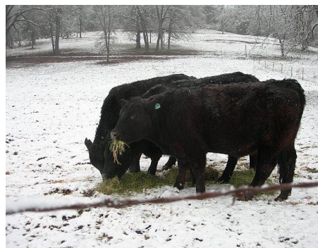
and three of our steers getting themselves ready for market.