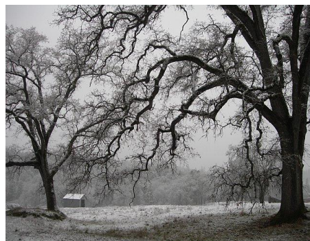
A light dusting of snow